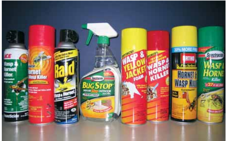
Figure 10. Ready-to-use aerosol jet-sprays and liquid pump-trigger sprays are suited for direct application to wasp nests.

Longer-lasting pyrethroid insecticides for yellowjackets, bald-faced hornets, and paper wasps include beta-cyfluthrin, bifenthrin, cyfluthrin, lambda-cyhalothrin, deltamethrin, permethrin, and tralomethrin. These provide excellent control by themselves as well as in ready-to-use mixtures with short-residual ingredients.