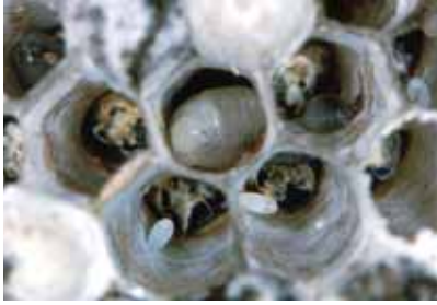
Figure 6. Eggs (bottom two cells) and larva (middle cell) are visible within nest cells; capped cells (upper right and lower left) contain wasp pupae.

infertile (non egg-laying) females. Males are not produced until September.