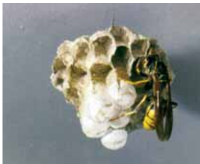
Figure 5. Paper wasps build nests that resemble an open umbrella with individual comb cells open to view from below.

the most common type of paper wasp throughout the Gem state until the late 1990s. Although this native species still occurs in rural areas of Idaho, it largely has been displaced in urban habitats by Polistes dominulus , the European paper wasp.