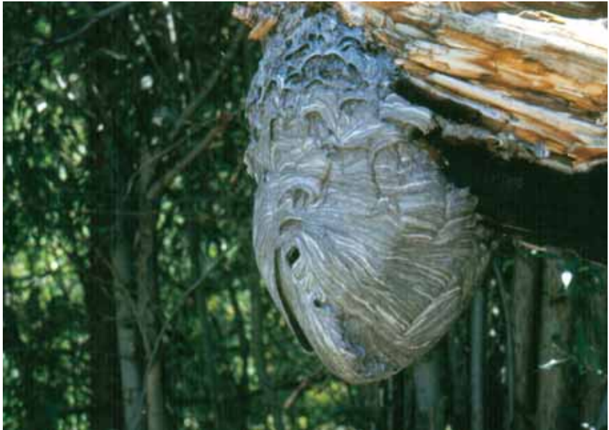
Figure 4. Bald-faced hornet nest is similar in form to subterranean yellowjacket nests but always is located above ground, usually on landscape plants or buildings. They can get as large as soccer balls by early fall. Note two nest openings through the outer wall on the left side, bottom third.

The golden paper wasp, Polistes fuscatus aurifer , a yellow-to-reddish-brown wasp with yellow banding, was