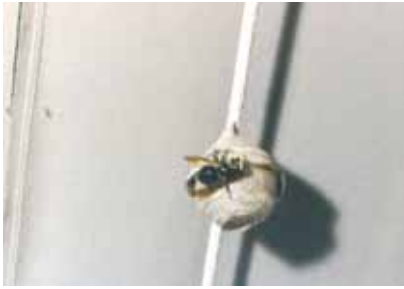
Figure 7. Bald-faced hornet queen begins springtime nest construction. Reduce sting hazard by destroying early-season nests in problem areas while the colony consists solely of the overwintering queen.

Never pour kerosene or gasoline into subterranean nests. This practice poses high hazard of explosive fires plus soil contamination and groundwater pollution.