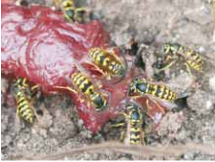
Figure 1. Yellowjacket workers scavenge food from meat scraps.