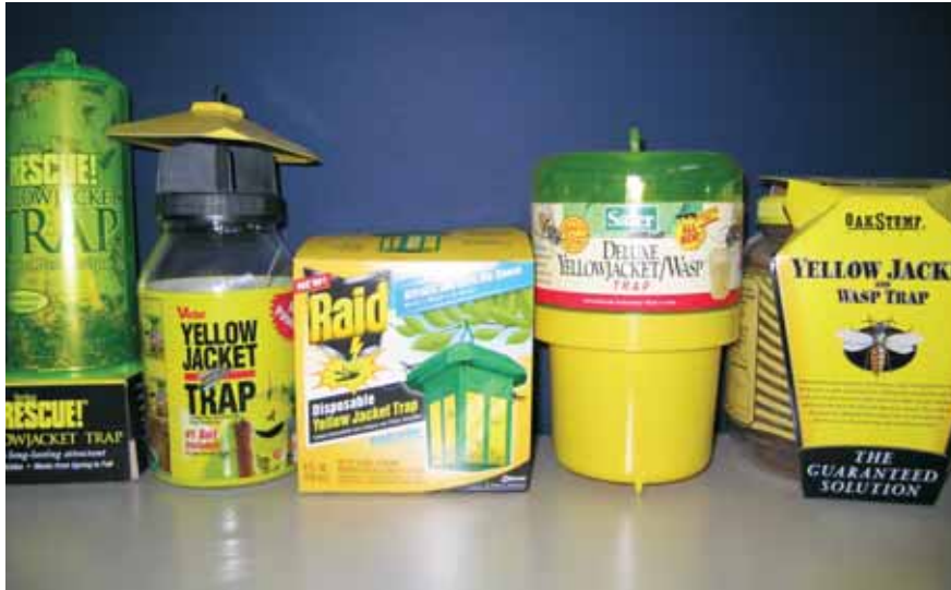
Figure 9. A variety of yellowjacket traps are widely available from retail stores for backyard use.

like canned, fishy cat food, luncheon meats, and fruit juices attract yellowjackets, but usually not as many as synthetic heptyl butyrate.