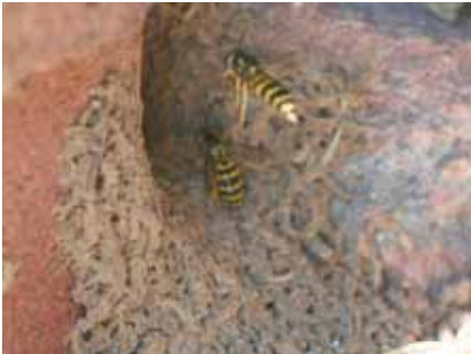
Figure 2. Yellowjacket workers hover near opening to nest located in hidden cavity behind brick wall.

also feed mouth-to-mouth on liquids produced by their larvae. As summer progresses and insect prey becomes scarce, western and common yellowjackets increasingly feed as scavengers on non-living proteinaceous (protein) and sugary foods.