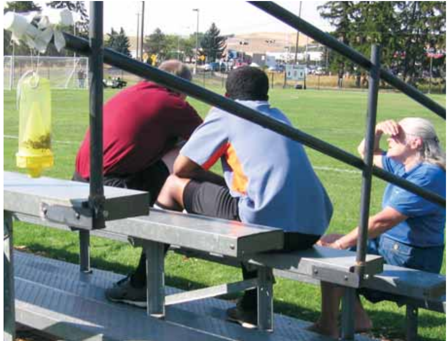
Figure 8. Yellowjacket trap is hung too close to a site frequented by people. This incorrect trap placement can increase sting threat by drawing wasps to the area.

Yellowjackets readily can be captured and killed in a variety of commercial and home-made traps. All traps work on the same principle: yellowjacket workers that scavenge for non-living protein and carbohydrate foods are captured inside